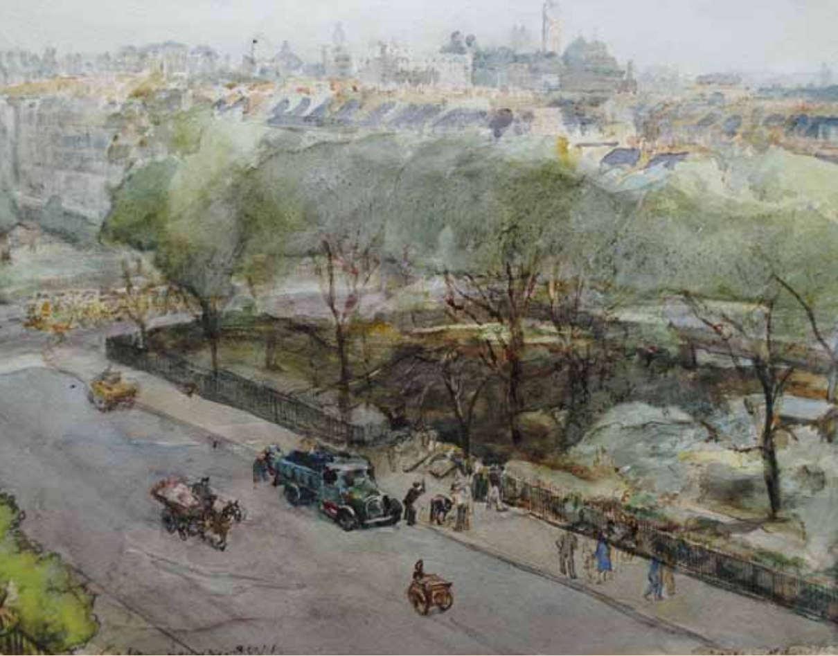
Troop movements and requisition of railings, Eaton Square, 1942 CAT. 20 Watercolour, signed and dated