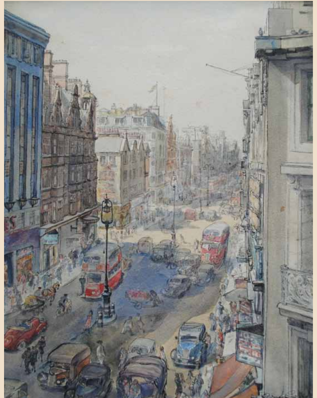
Charing Cross Road, 1940 CAT. 19 Watercolour, signed and dated