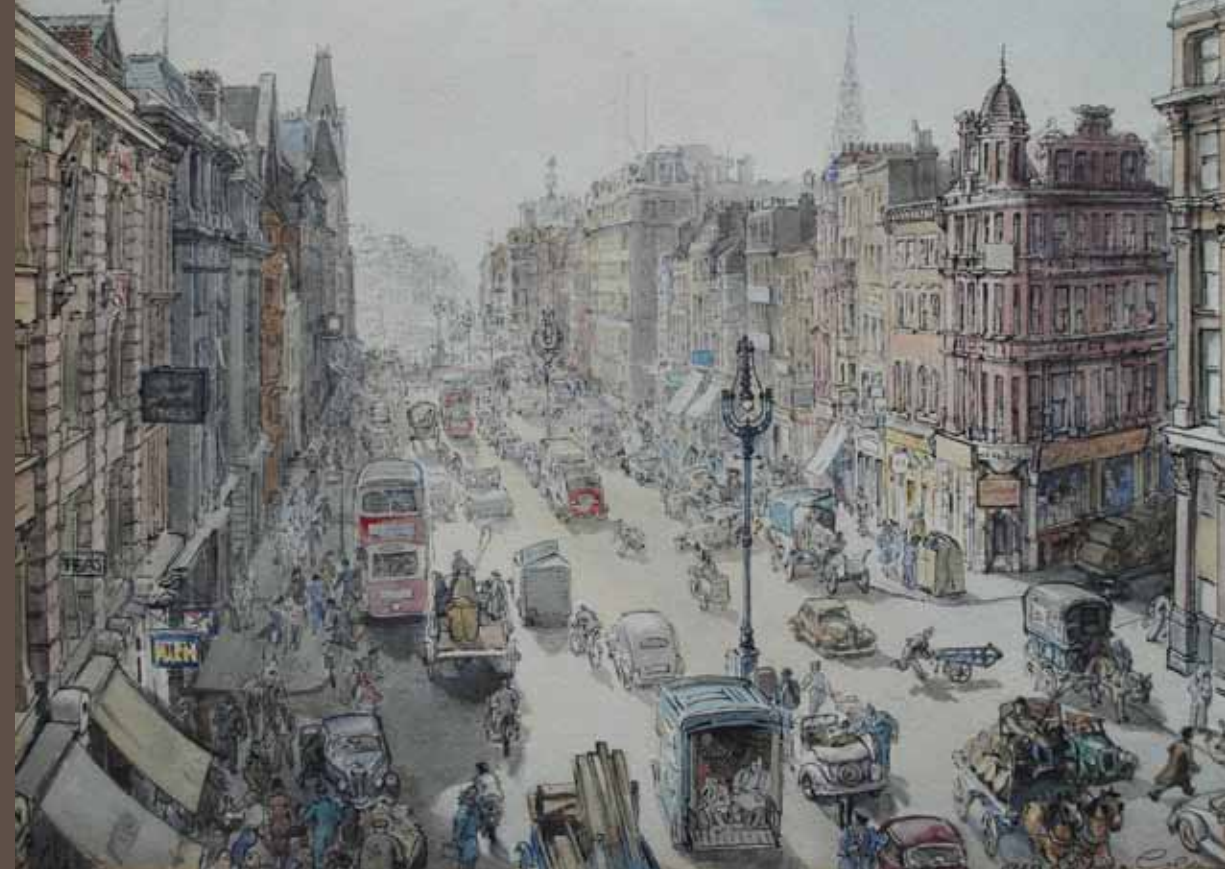
Fleet Street, 1941 CAT. 15 Watercolour, signed and dated

Her work is held in numerous public collections, most notably the Museum of London, which holds an extensive archive, the Tate, the V&A and the National Archives.