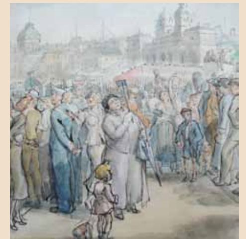
Horse Guards Parade, 1938 CAT. 26 Watercolour, signed and dated