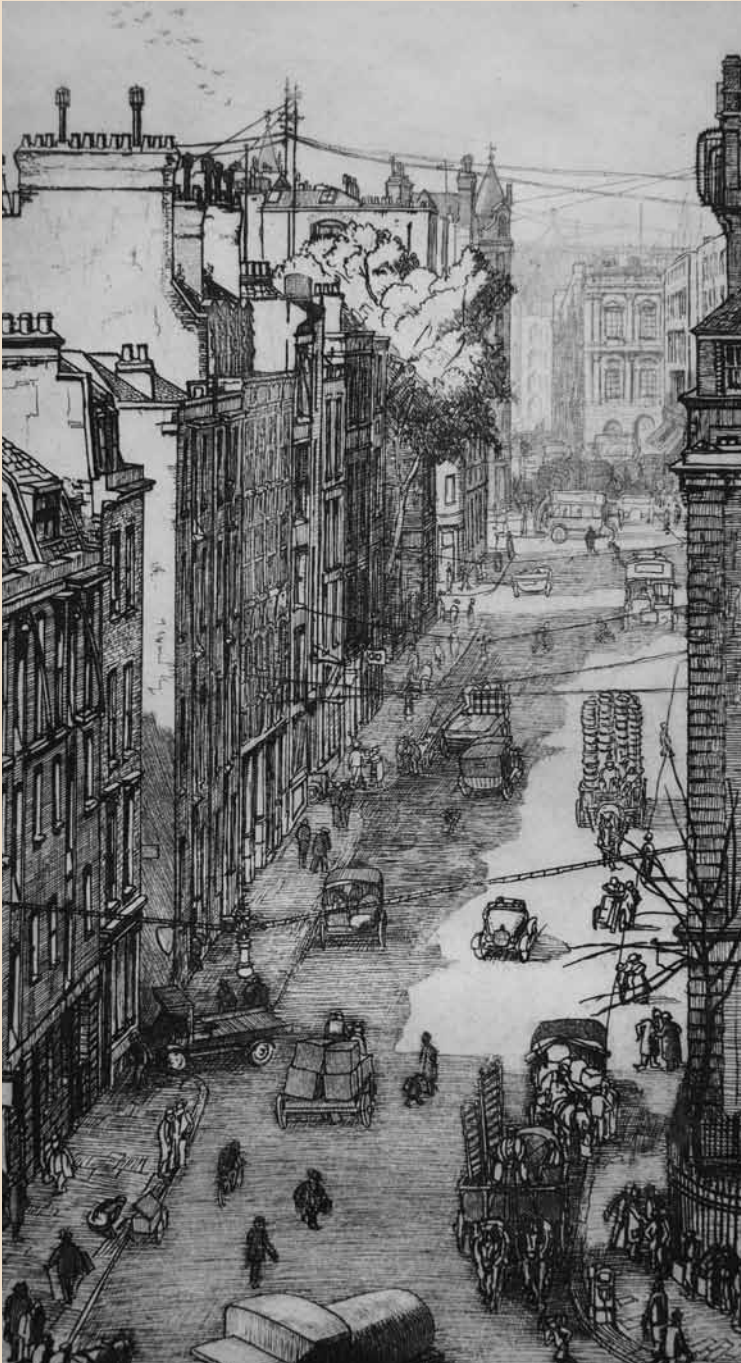
Queens Street Place, EC1 CAT. 18 Lithograph