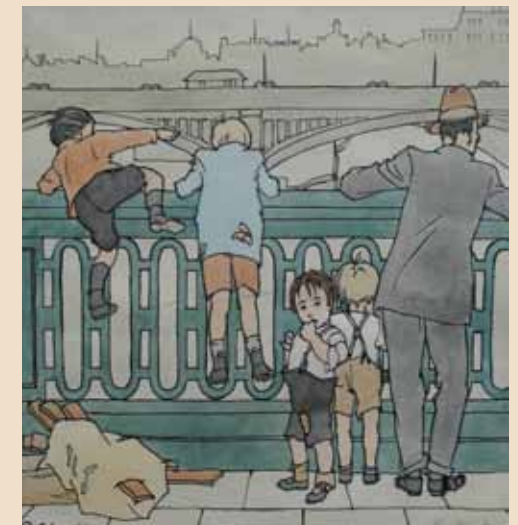
The Bridge CAT. 17 Watercolour