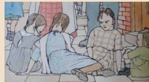
Four Stones CAT. 16 Watercolour