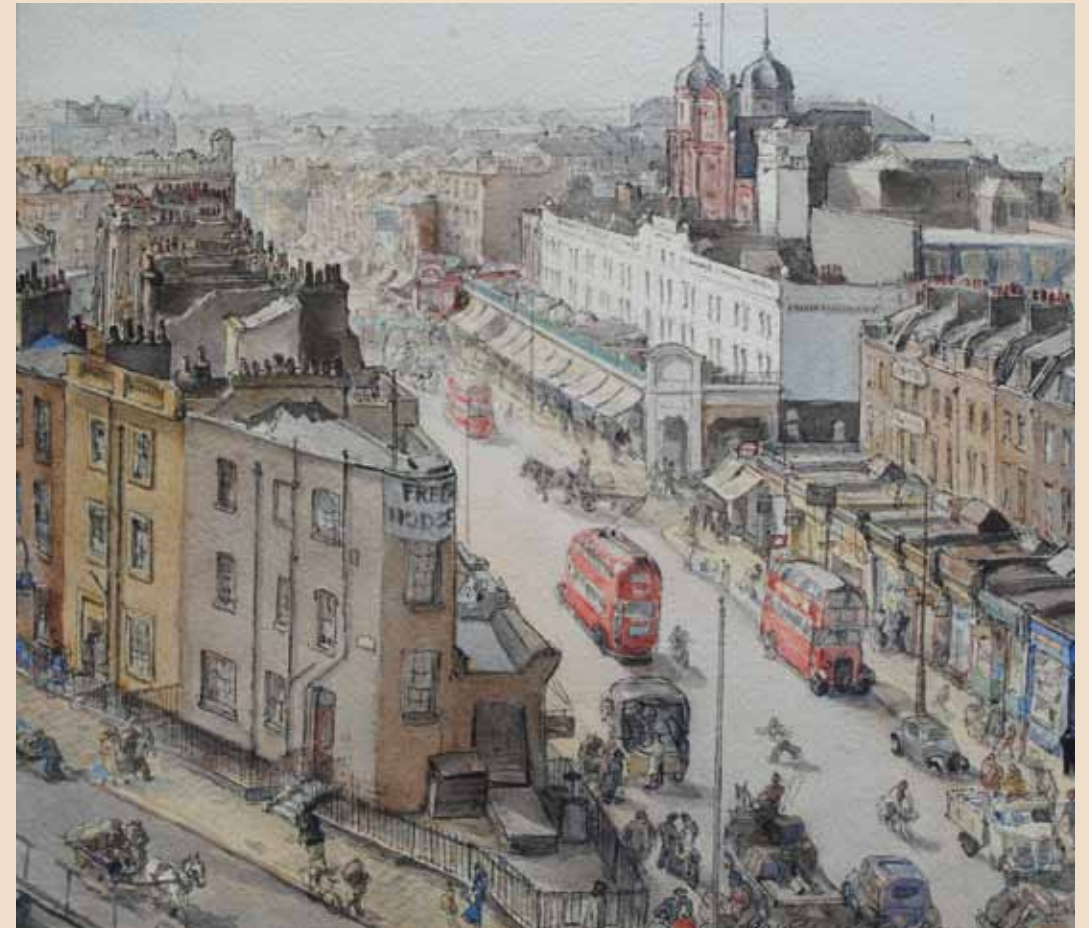
London in Wartime, 1941 CAT. 22 Watercolour, signed and dated