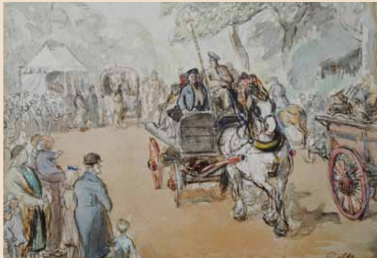
Carriage Rides, 1938 CAT. 24 Watercolour, signed and dated