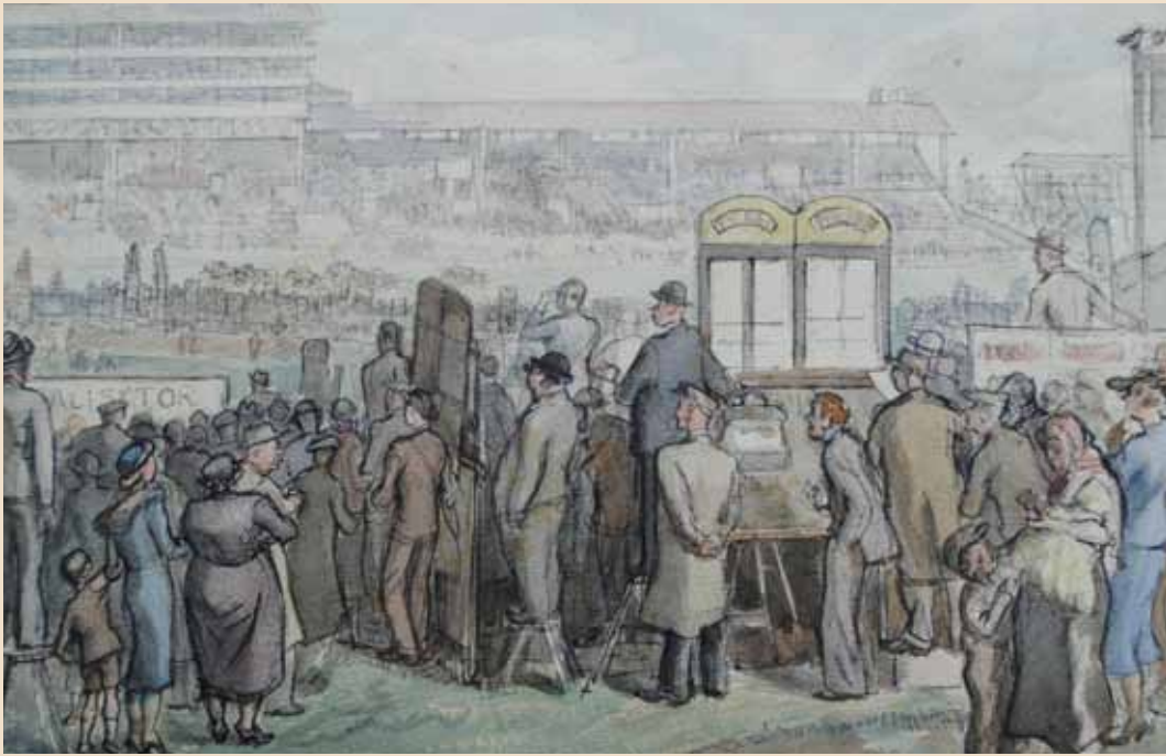
The Hill, Epsom, 1938 CAT. 23 Watercolour, signed and dated