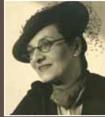
c. Estate of Grace Golden